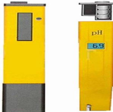
Fig. 9 pH meter

pH can be measured by two ways one litmus paper and pH meter and pH meter is accurate in the both methods.