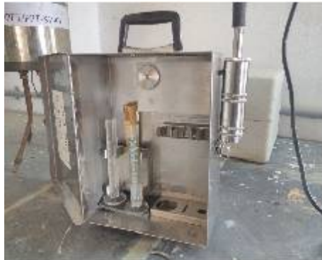
Fig. 5 Retort Kit