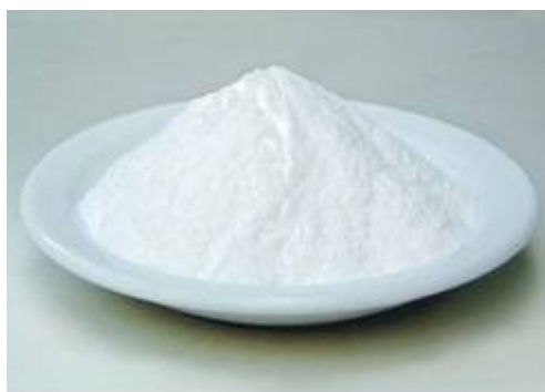
Fig.1 STTP (Sodium tri-polyphosphate)

an emulsifier and to retain moisture. Many governments regulate the quantities allowed in foods, as it can substantially increase the sale weight of seafood in particular