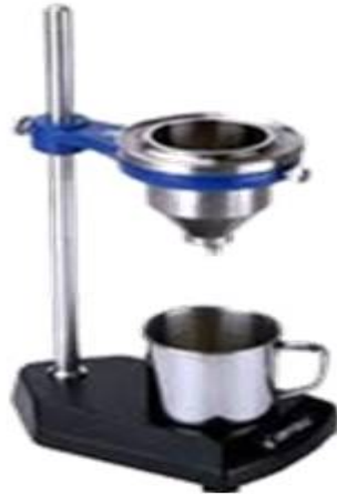
Fig. 8 Viscosity cup