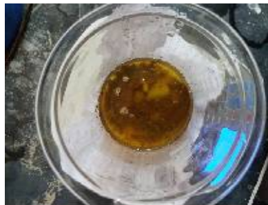
Fig. 4 Biodiesel oil based mud

To prepare sample of oil based mud(OBM) Take 150gm of Barite , 46gm of bentonite,8 gms of STTP and 200ml of biodiesel initially and mix it for 8 min so that no solids are present in the fluid. Prepare another sample of 150gm of Barite, 46gm of bentonite,8 gms of Sodium silicate and 200ml of biodiesel initially and mix.