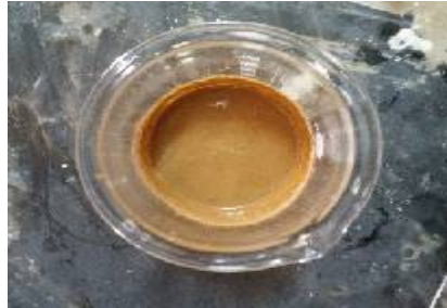
Fig. 3 Water based mud