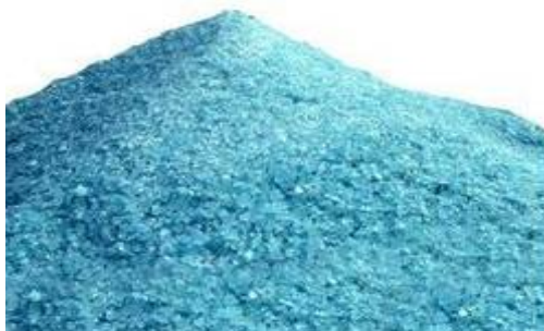
Fig.2 Sodium Silicate

It is particularly useful when drill holes pass through argillaceous formations containing swelling clay minerals such as montmorillonite.