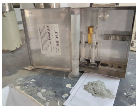
Fig. 7 Retort Kit (Oil based mud)