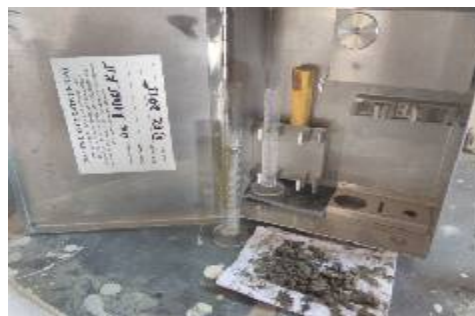
Fig. 6 Retort Kit (Water based mud)